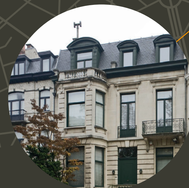
24, Avenue des Klauwaerts, Ixelles.